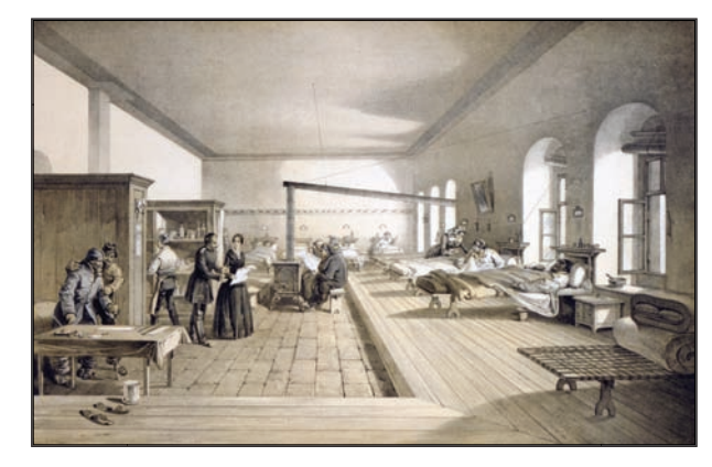
Drawing of Florence at the hospital in Turkey in 1856

Florence died in 1910 at 90 years old. She still inspires many people to become nurses.