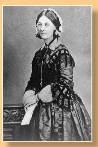
Florence about 1860