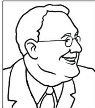
FRANKLIN D. ROOSEVELT