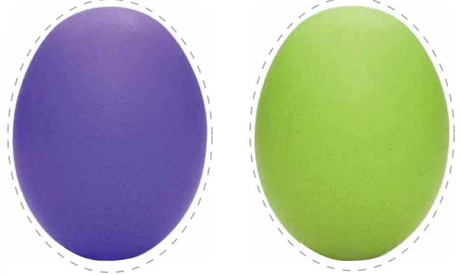
COLORED EASTER EGGS