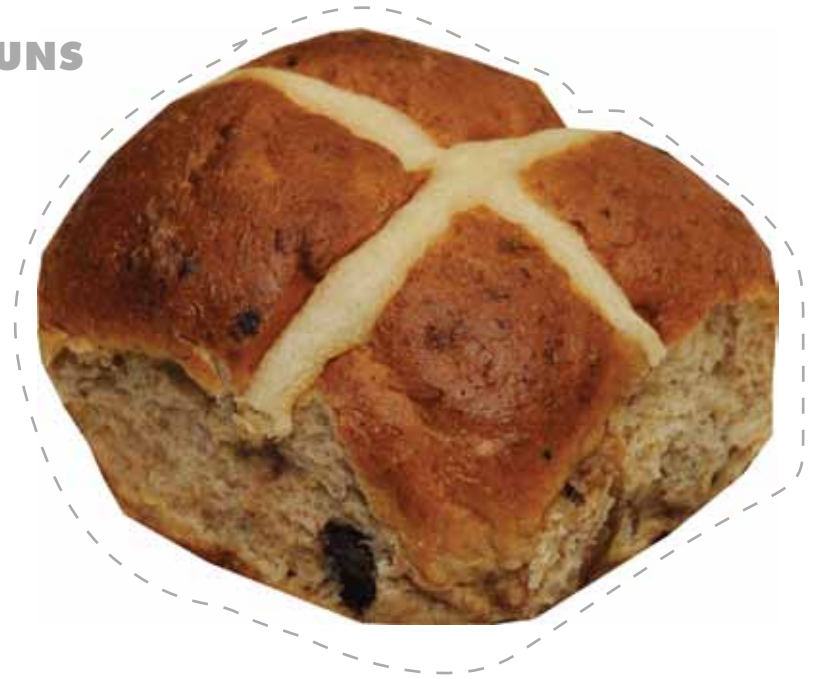
HOT CROSS BUNS