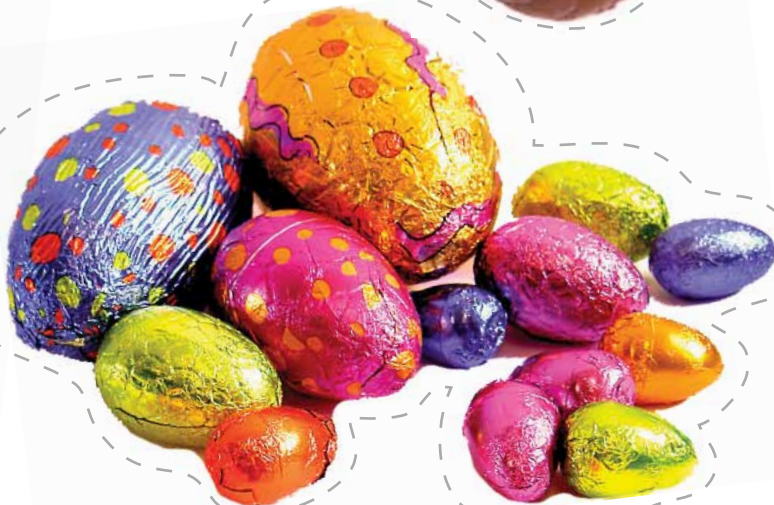
CHOCOLATE FOIL EGGS