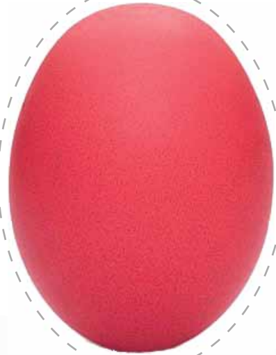
COLORED EASTER EGGS

Works best when printed on thicker paper!