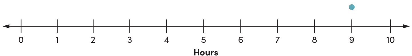
Time Spent Playing Video Games