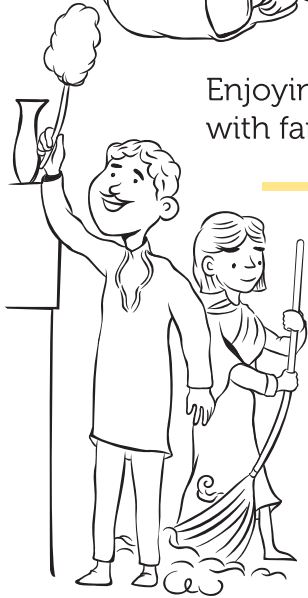
Cleaning the house.