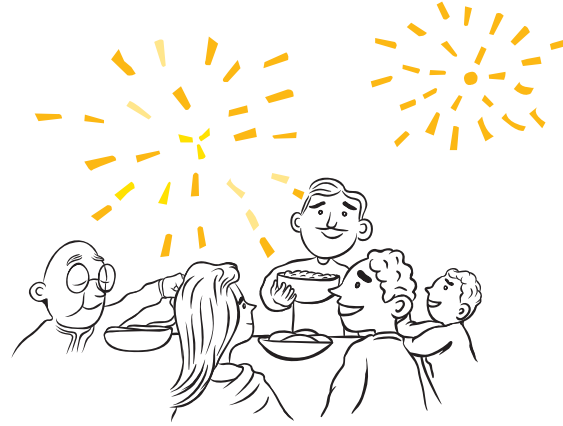
Having a delicious feast while watching fireworks.