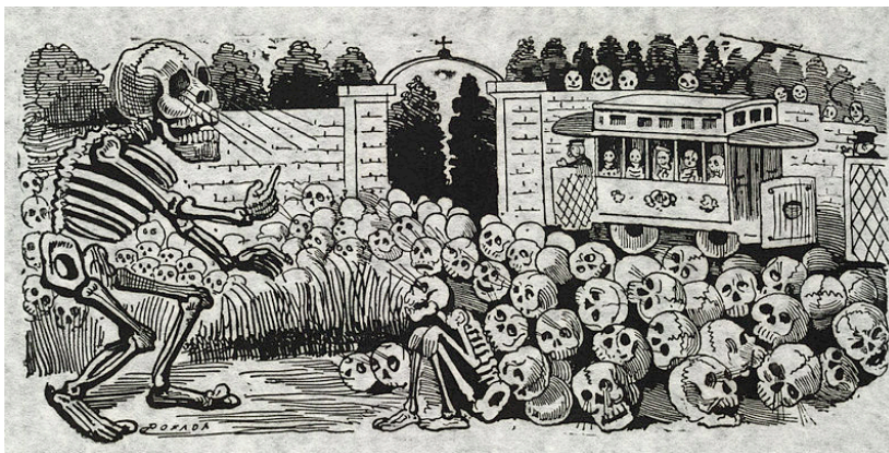
A Mexican print drawn for Día de los Muertos in the early 1900s.