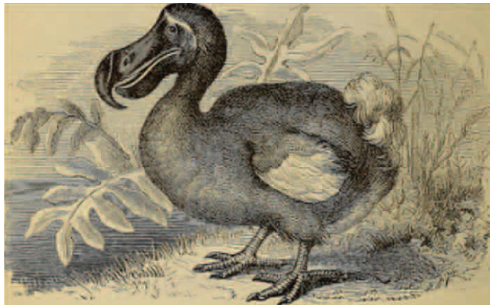
Illustration of a Dodo bird by Louis Figuier from 1873

Because it took so little time after human contact for this animal to go extinct, the dodo bird has become a symbol of the role of humans in protecting endangered animals.