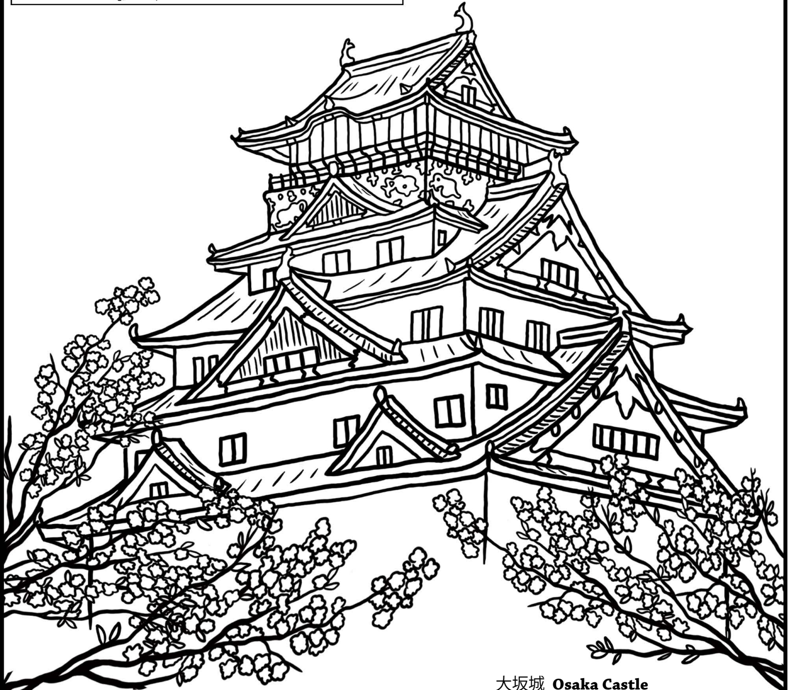
大坂城 Osaka Castle

The original castle was built in 1583, the largest in Japan at the time. It was the site of major battles – even destroyed by fire then reconstructed. Lightning burned down the main tower in 1665, not to be rebuilt until 1931.