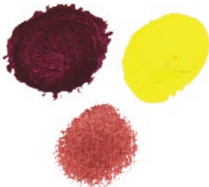
Purple & Yellow