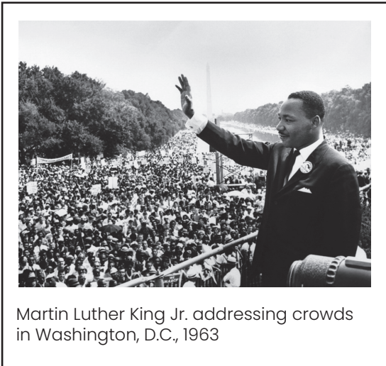
Martin Luther King Jr. addressing crowds in Washington, D.C., 1963