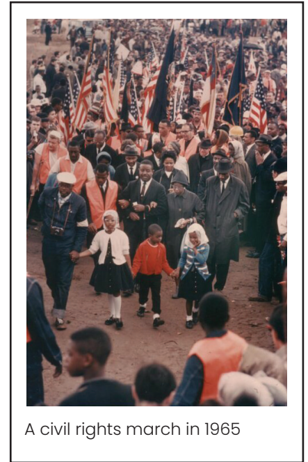
A civil rights march in 1965

Captured by Ralph David Abernathy in 1965 CC BY-SA 4.0