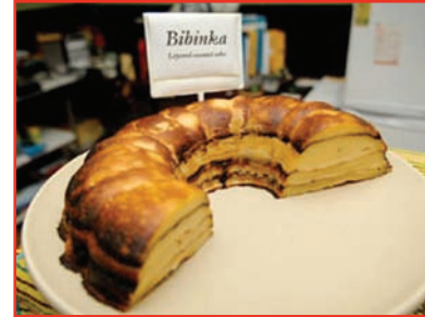
Bibinka is a popular Christmas treat.

In the Philippines, people celebrate many different holidays during the Christmas season. The season begins on December 16. People attend an early morning church service each day for nine days. This series of services are called Simbang Gabi in the Filipino language. It is a very important time for the people of the Philippines. When services are over, many people will buy special holiday treats from shops. One treat is bibinka, which is a rice and egg cake.