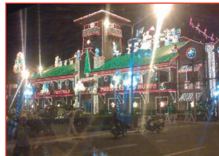
Christmas lights are very popular in the Philippines.

The Christmas season continues with celebrations on New Year's Eve. Filipinos make loud noises to drive away bad luck.