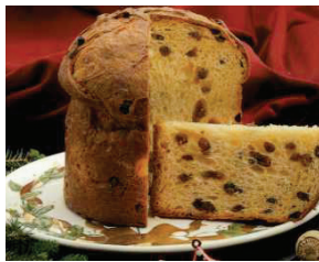
Panettone, a sweet Italian bread with raisins