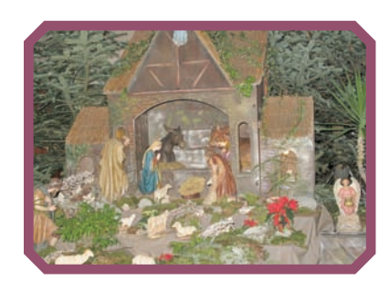
A French nativity scene, called a creche

The French people enjoy decorating for the Christmas season. They string lights along the streets. The Eiffel Tower is covered in lights. Many department stores have special windows for displaying holiday scenes.