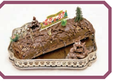
A buche de Noel

Food is an important part of the Christmas celebration in France. Favorite Christmas foods are lobster, oysters and chestnuts. On Christmas Eve, families have a large dinner, called a reveillon. The food is very elegant and the dinner lasts a long time. A traditional dessert is a buche de Noel, which means Yule log. It is a cake with chocolate icing decorated to look like a wooden log. In some areas, families will have 13 different desserts.