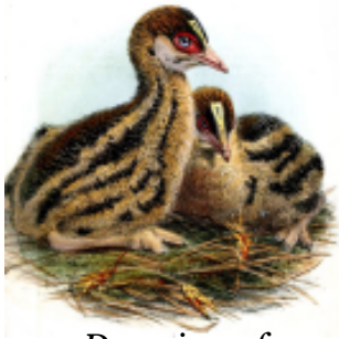
Drawing of cassowary chicks

A cassowary is a bird found in northeastern Australia, New Guinea and other islands nearby. Like the ostrich and emu, the cassowary cannot fly.