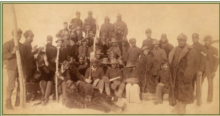
Buffalo Soldiers in 1890

Many Buffalo Soldiers were awarded the Medal of Honor. They were also recognized for their bravery in the charge up San Juan Hill in the Spanish-American War.