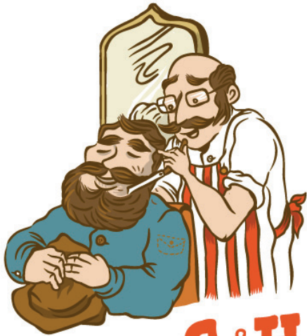
Shave and a haircut.