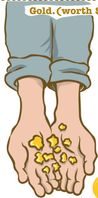
Gold. (worth $5)