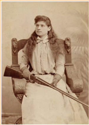
Annie Oakley in about 1899.