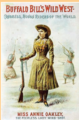
Annie Oakley on a poster for the Buffalo Bill's Wild West show.