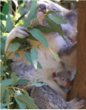
A small baby koala with its mother

The koala comes from Australia. It is found in four Australian states: Queensland, Victoria, New South Wales and South Australia.