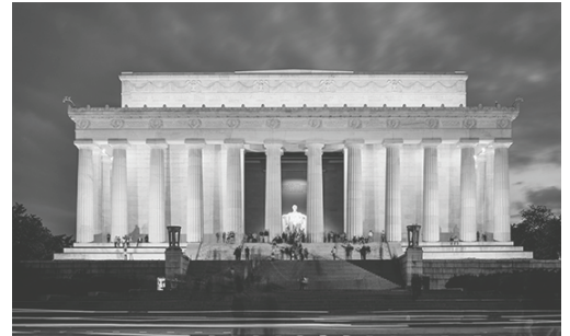
The Lincoln Memorial at night