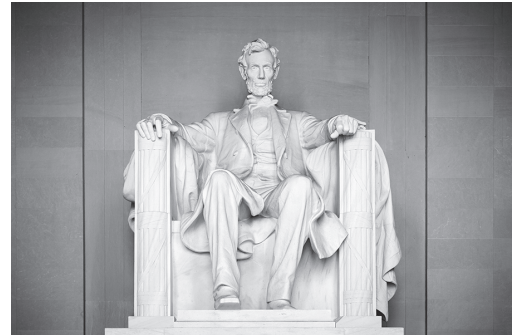
Statue of Abraham Lincoln