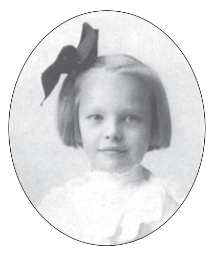
Amelia Earhart as a child.

Amelia's life encouraged many other women to become pilots. She also educated the public about flying and airplanes.