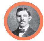
— Edward Kasner