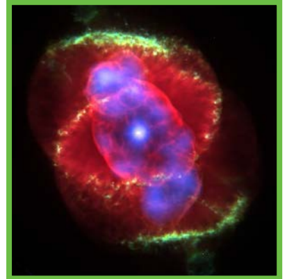
Cat's Eye Nebula