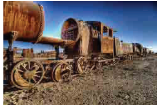
oxidation (rust) - causes discoloration on rocks