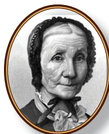
Laura Smith Haviland 1808-1898

A conductor in the Underground Railroad, Rev. Rankin hid over 2,000 escaping slaves in his Ohio home.