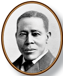
William Still 1821-1902

The Underground Railroad used codes to keep the activities secret. A conductor was a person who helped guide those escaping. A station master hid escaping slaves in a “depot,” or safe house.