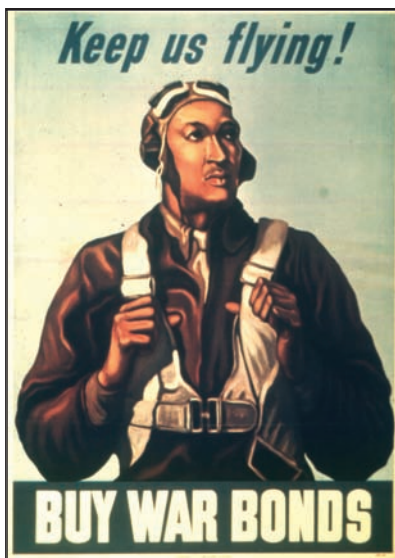
War bond poster showing a Tuskegee Airman

The Tuskegee Airmen were the first African American pilots to fly for the U.S. military. When they were formed in 1941, military rules did not allow white pilots and African American pilots to serve in the same unit. The Tuskegee Airmen were created as a separate unit, which began training at an air field in Tuskegee, Alabama. The Tuskegee Airmen were also known as “Red Tails” because they painted the tails of their planes red.