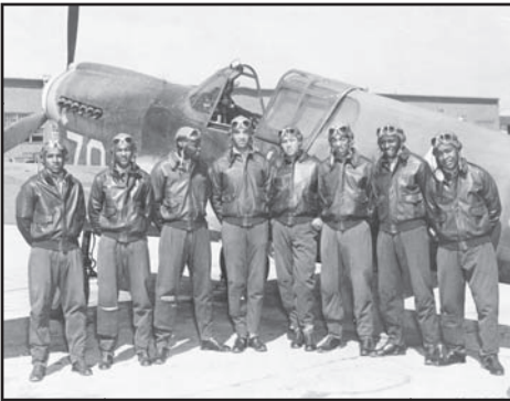
Tuskegee Airmen with a fighter plane