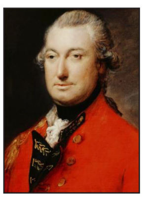
Lord Charles Cornwallis, commander of the British forces at the Battle of Guilford Court House

The battle lasted about 90 minutes. General Greene retreated to save his troops and the British claimed victory.