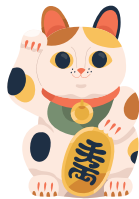
Maneki-neko (beckoning cat)