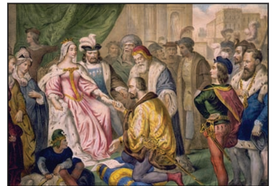
Painting of Isabella and Ferdinand meeting with Christopher Columbus.

Isabella died in 1504. Her children married into many of the royal families of Europe, including England and Portugal.