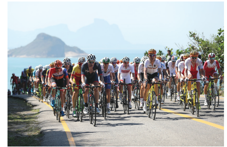
Men's Road Cycling, Rio 2016 Olympics