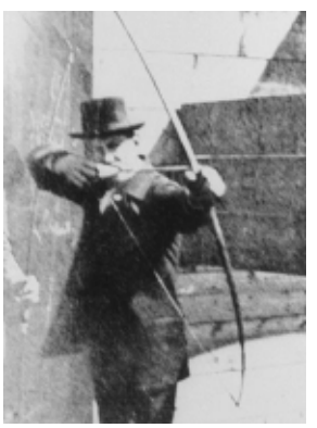
Olympic archer at the 1900 Olympics

Since shooting arrows is dangerous, the rules for safety are very strict. Archers are not allowed to start shooting until given a signal. Archers are not allowed to pick up their arrows until a field captain announces that everyone has finished shooting.