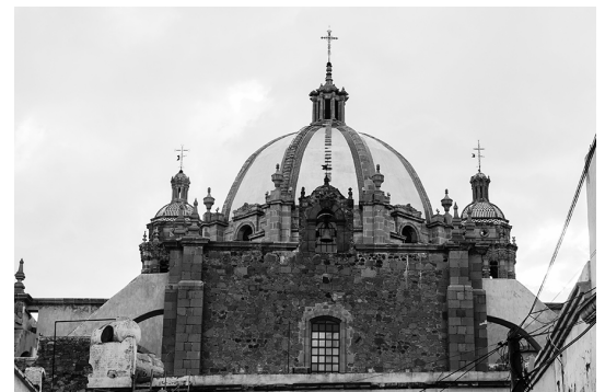
Historic Centre of Zacatecas, part of the Camino Real de Tierra Adentro.

The Native Americans were just one of many groups that have relied on El Camino Real as a trade route. For instance , in 1598, the Spanish used the trail to send over 500 settlers to northern New Mexico. This made the trail an official Spanish trade route, which would be used for the next 300 years. Today, several modern highways cover parts of the historic route, though large sections are on city streets, as well .