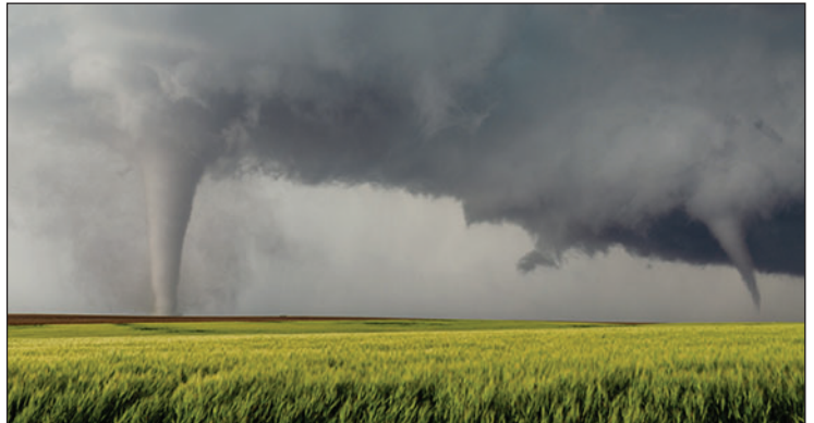
Usually a tornado is in the form of a funnel-shape. Sometimes it looks like a rope.

Wild weather comes in many forms. Tornadoes and waterspouts are directly related and look alike. Both weather events require attention because they can be dangerous to humans and animals. Wild weather is fascinating, and it is completely unpredictable sometimes!