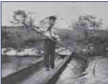
A Seminole fisherman

The Seminole tribe of Native Americans began when members of the Creek tribe moved to Florida in the 1700s and united with other tribes. Their language is similar to the Creek language.