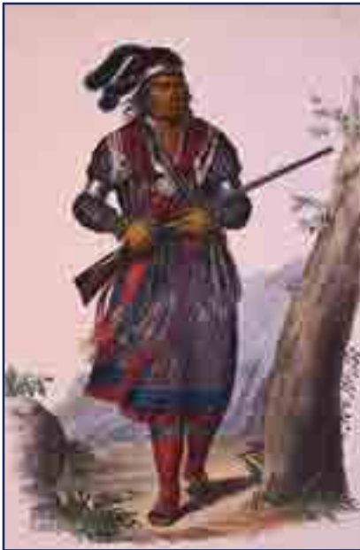
A Seminole man wearing traditional clothes about 1842.