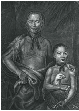
Chief Tomochichi and his nephew in 1733

After the American Revolution, President George Washington established a plan to encourage Native American tribes to adopt European culture and traditions. The Muscogee tribe were the first to follow this plan, followed by the Cherokee, Chickasaw, Choctaw and Seminole. The tribes that became part of the plan were called the “Five Civilized Tribes.”