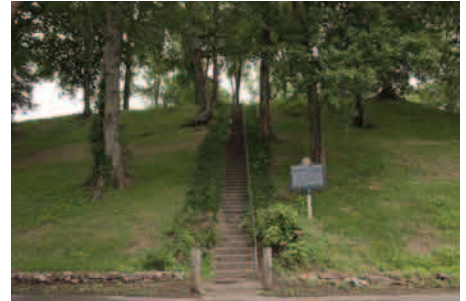
Earth mound in Florence, Alabama

The Muscogee, or Creek, Native Americans were originally part of the Mississippian culture in Tennessee. The Muscogee would later move south to Georgia and Alabama where they owned a large amount of land. The ancient Muscogee used earth mounds as platforms for buildings in their villages.