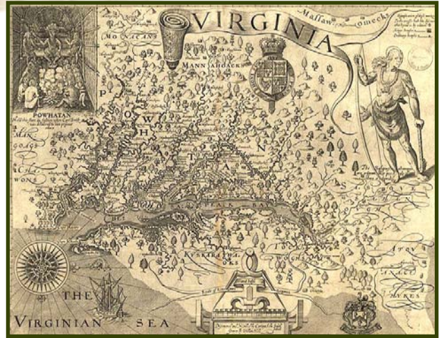
Capt. John Smith drew this map of Virginia in 1624.

After the early years of hardship, Jamestown grew and more colonists arrived. They spread out across Virginia to live and farm. Today, Jamestown has been restored and is part of the Colonial National Historic Park.