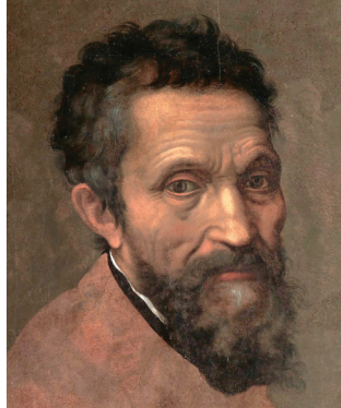
Michelangelo (1475 - 1564)