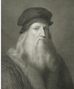
Leonardo da Vinci (1452 - 1519)

Read the descriptions of Renaissance characteristics associated with these Renaissance artists and their paintings. Then use the word bank and paintings on page 1 to match the painting associated with each statement.