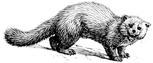
a. Pine Marten