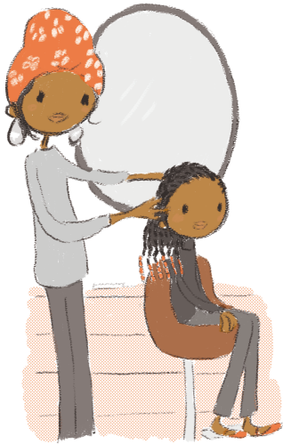
hair dresser s