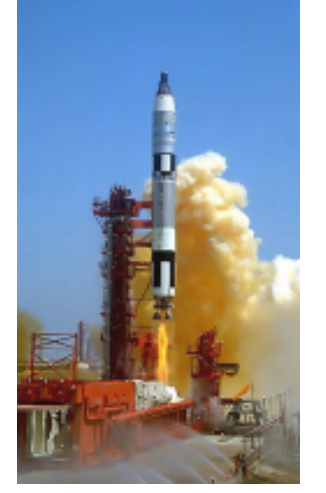
Launch of Gemini 4

Gemini 4 splashed down safely on June 7, 1965 after four days in space. It had orbited the earth 66 times.