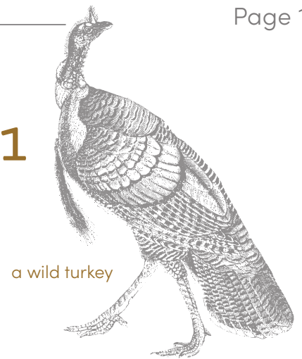
a wild turkey