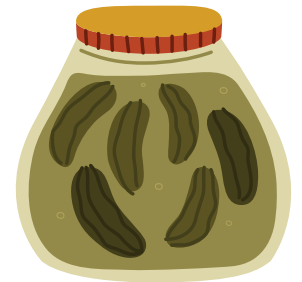
Homemade pickles and preserves

1. having leaves that stay green all year