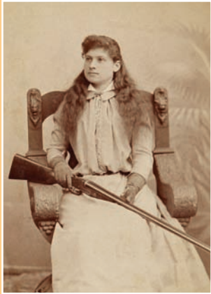
Annie Oakley in about 1899.