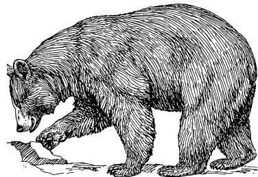
a. Black Bear