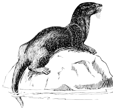
b. River Otter