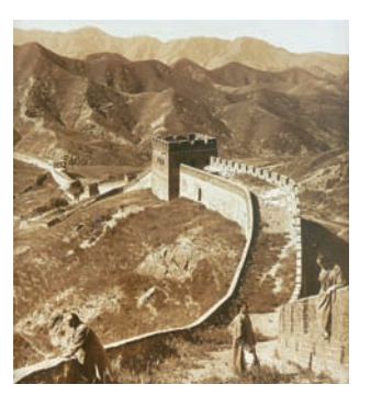
The Great Wall of China was built mostly during the Ming Dynasty. The wall is over 3,800 miles long.

At the end of the Ming period, the military suffered numerous defeats. Crops failed due to bad weather conditions. The Ming Dynasty was overthrown by the Qing Dynasty, the last of the ancient Chinese dynasties. At the end of the Ming period, China had an estimated population of over 160 million people.