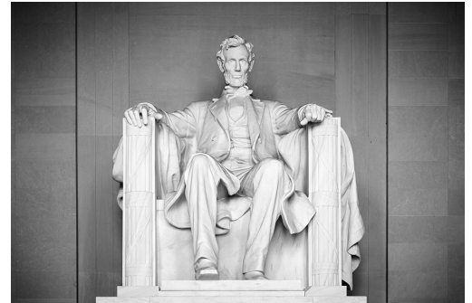
Statue of Abraham Lincoln