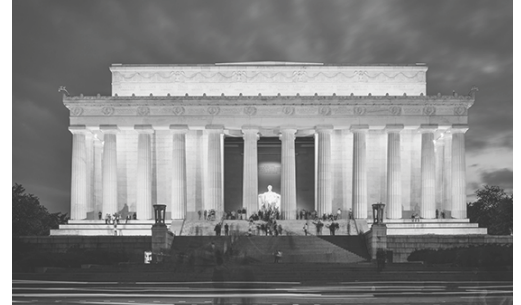
The Lincoln Memorial at night