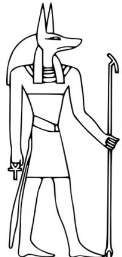
Color Anubis, the god of the afterlife

Ancient Egyptians placed their dead in decorated coffins called: